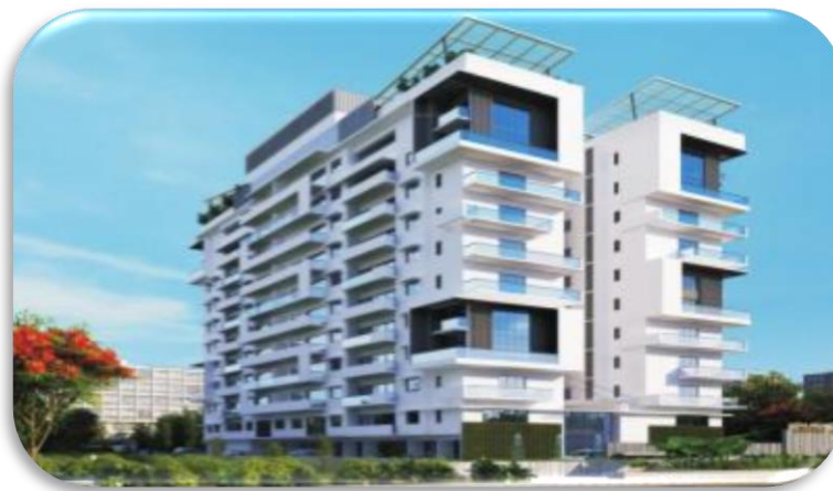
Bannerghatta Road, Bangalore