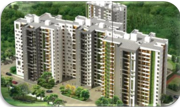
Nayanda Halli, Bangalore