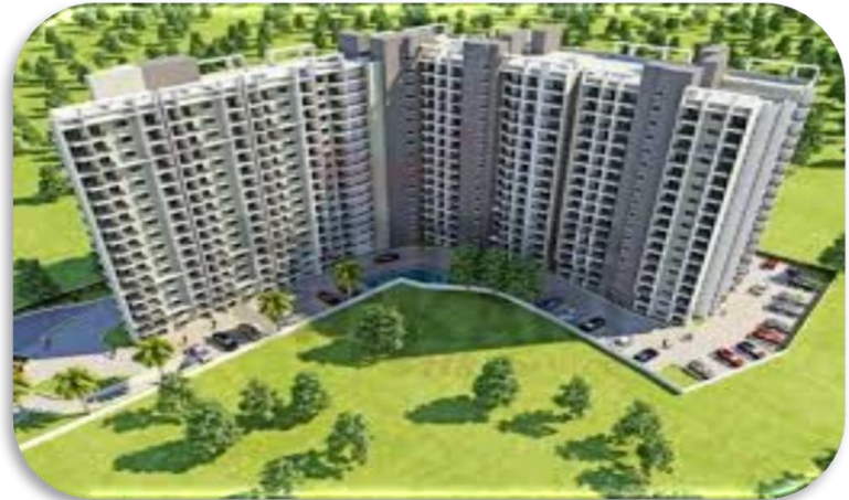
Sarjapur Road, Bangalore