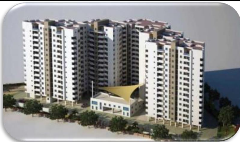
White Field, Bangalore