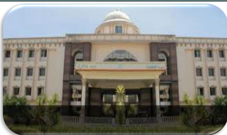
White field, Bangalore