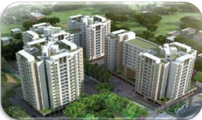
Thannisandra Road, Bangalore