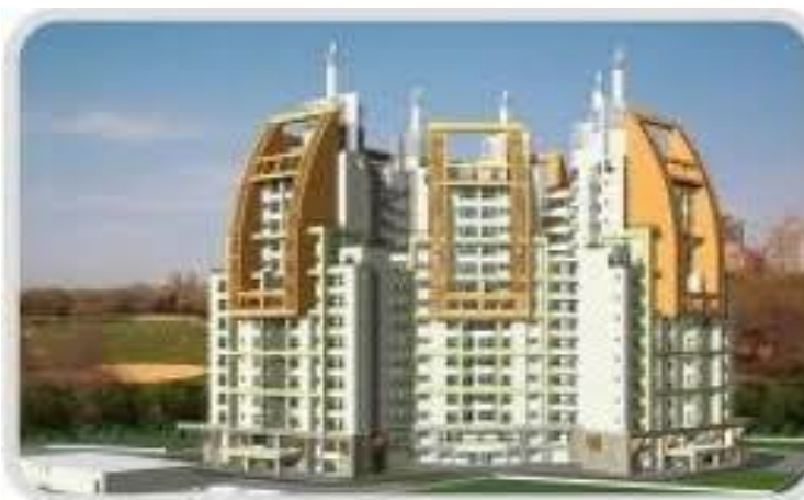
SL Mathias Road, Attavar, Mangalore