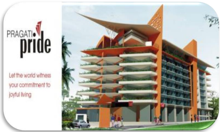
Alevoor Road, Mangalore