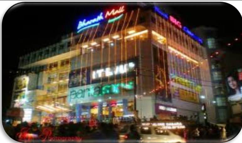
KS Rao Road, Mangalore