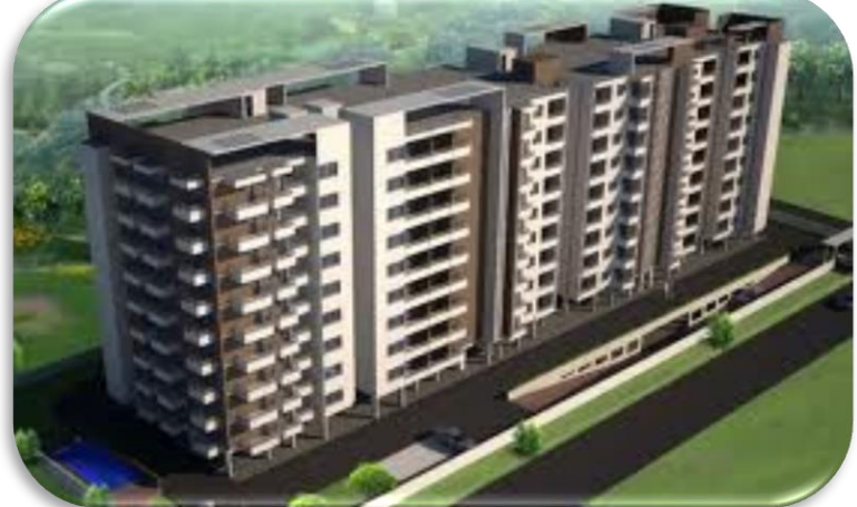
White Field, Bangalore