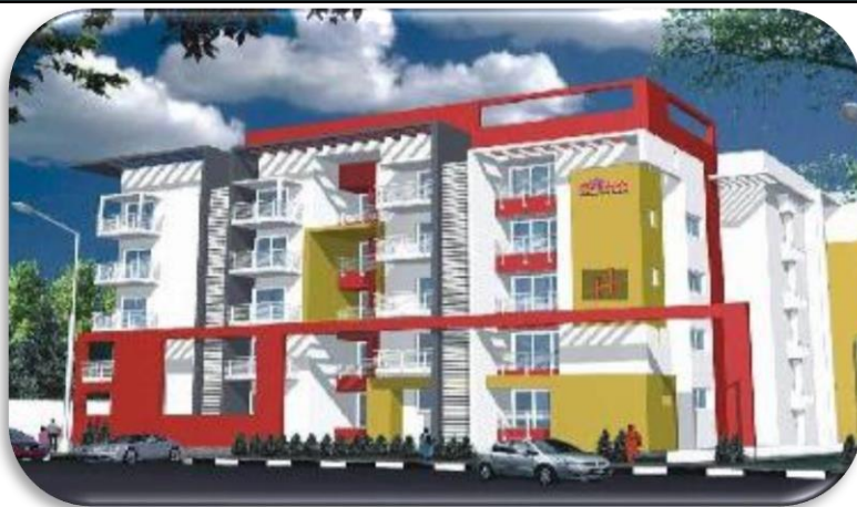
RC Nagar, Belgaum