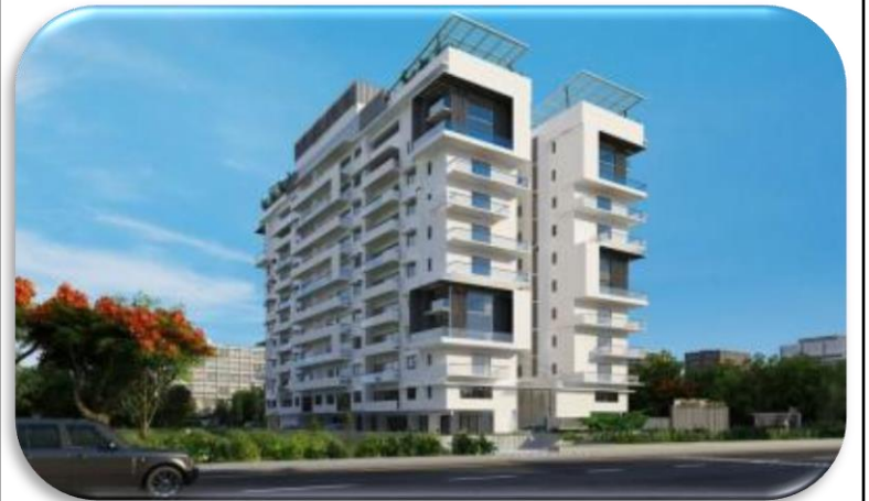
Bannerghatta Road, Bangalore