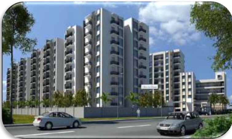
Sadhashiv Nagar, Bangalore