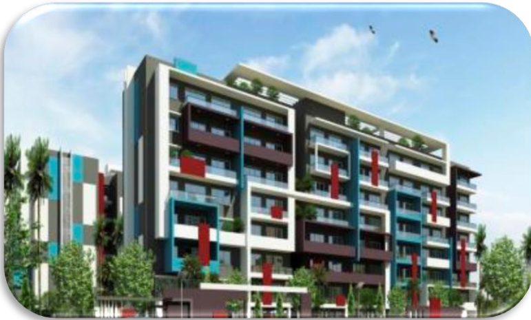
Electronic City, Bangalore