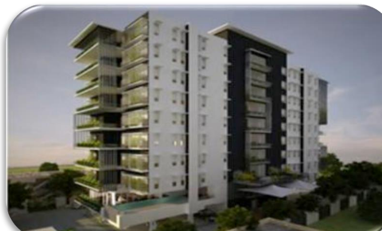
RS Puram, Coimbatore