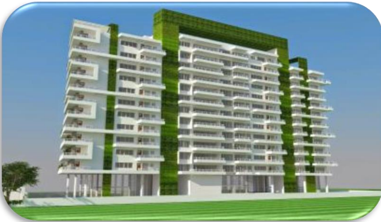
Dollars Colony, Bangalore