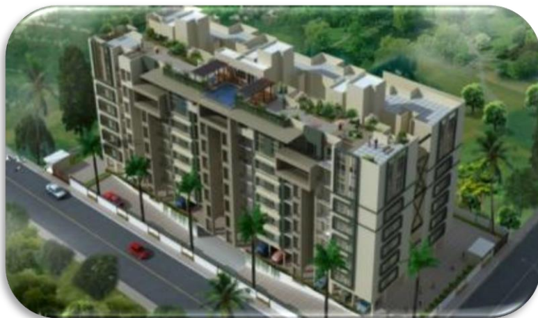
Sarjapura Road, Bangalore