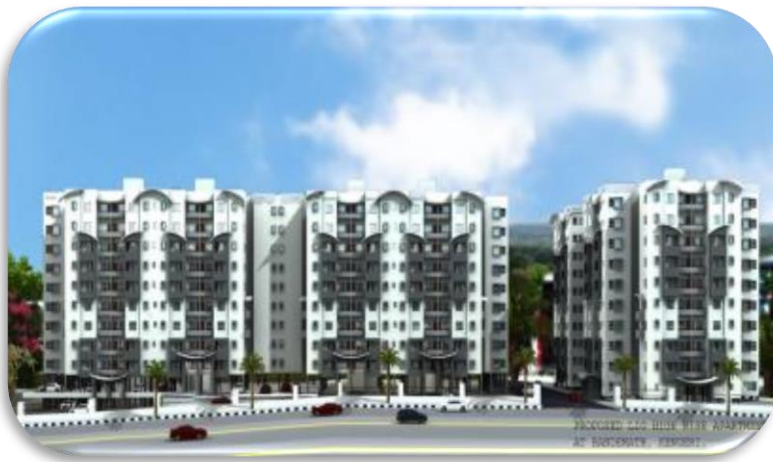
Kengeri Road, Bangalore