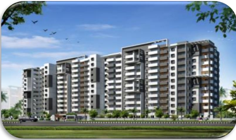
Housr Road, Bangalore