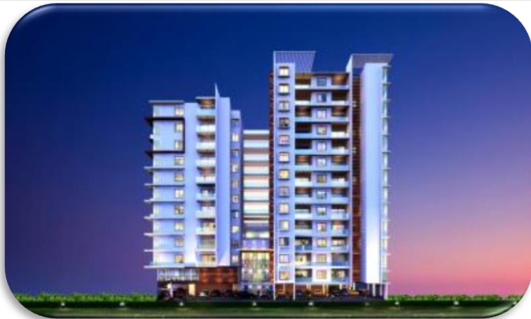
Kothanur Village, JP Nagar