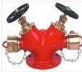
Water Sprinkler System