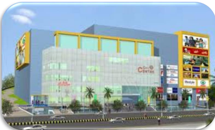
KS Rao Road, Mangalore