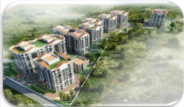
CV Raman Nagar, Bangalore