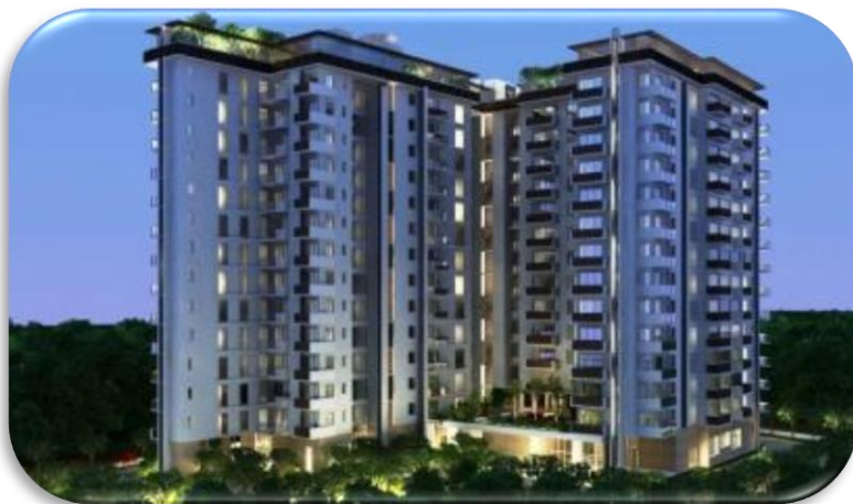
KR Puram, Bangalore